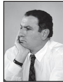
President Levon Ter-Petrossian

Before turning to the statement itself, I don't think it would be out of place to summarize some views expressed here over the last two days which are important from the point of view of the comprehensive clarification of the issue under consideration. I beg your pardon in advance if in some cases the summaries don't represent word-for-word reproductions of the views, but they are accurate in terms of content. Thus: